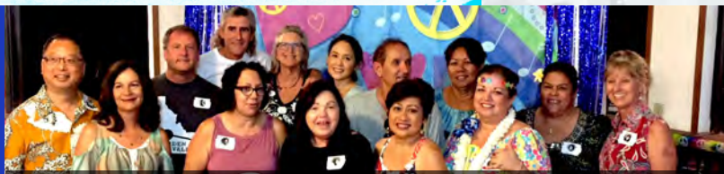
Class of 1977 grads from Makawao School. Photo taken at Stag Night at Oskie Rice Arena, held on Friday, October 13, 2017.