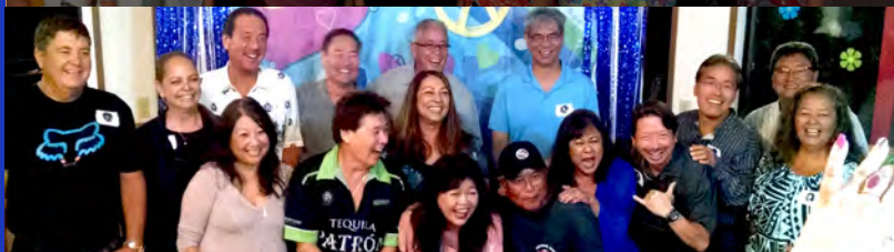
Class of 1977 grads from Kahului School. Photo taken at Stag Night at Oskie Rice Arena, held on Friday, October 13, 2017.