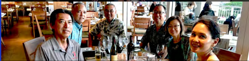
Mini-reunion of Maui High Class of 77 members who live on Oahu. Class members gathered for dinner at Mariposa Restaurant in Honolulu on Wednesday, Nov. 15, 2017.